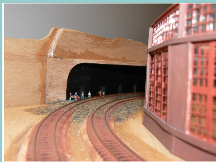
Part of 'N' scale layout and round-house Under Construction