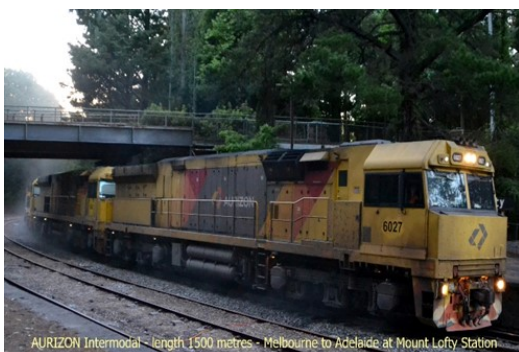
AURIZON Intermodal - length 1500 metres - Melbourne to Adelaide at Mount Lofty Station